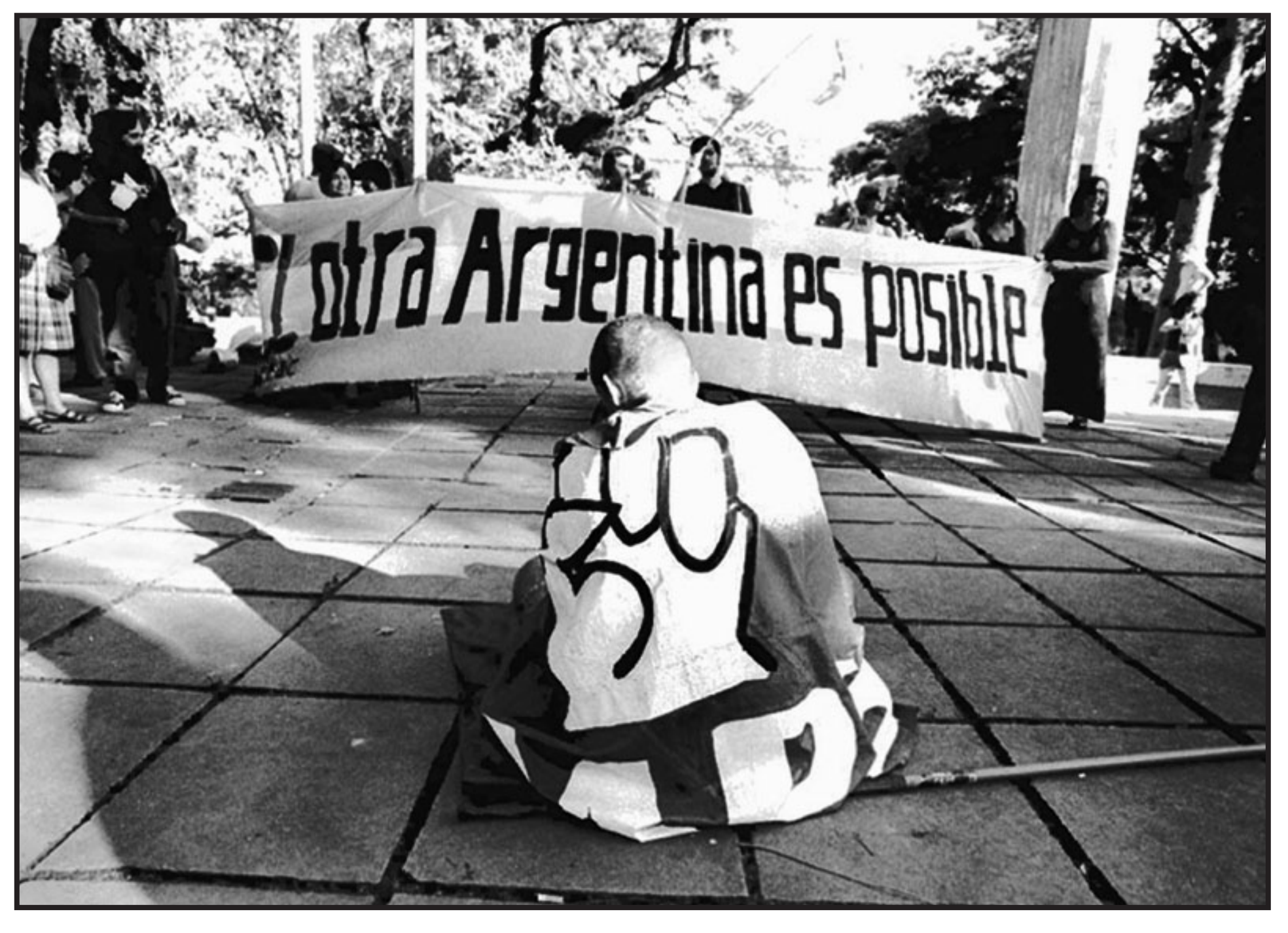
Argentinian solidarity demo at the World Social Forum in Porto Alegre, Brazil, February, 2002.